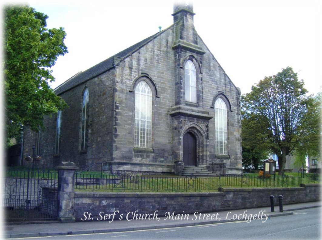
St. Serf's Church, Main Street, Lochgelly